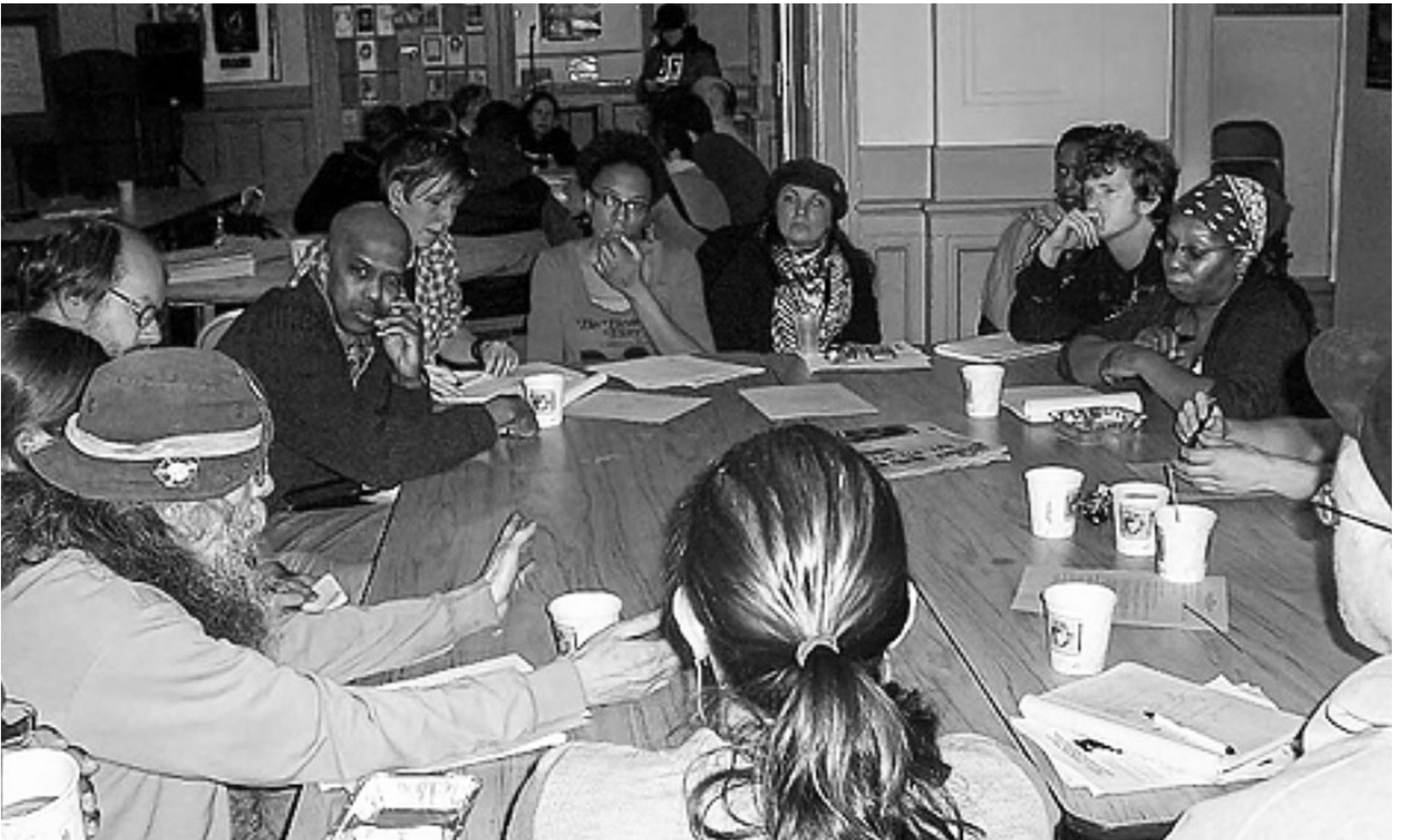
A session at the People's Movement Assembly (Detroit, MI)