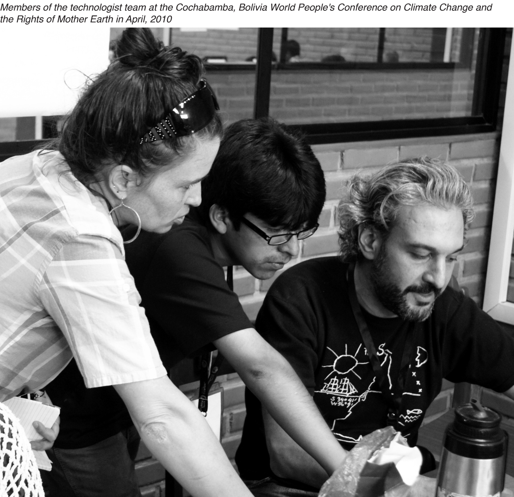
Members of the technologist team at the Cochabamba, Bolivia World People's Conference on Climate Change and the Rights of Mother Earth in April, 2010